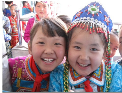
Students in Inner Mongolia between classes.