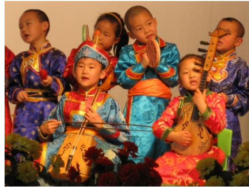
Kindergarten students performing for the "Vermont Delegation of Teachers"

inquisitive nature, so they too, will someday want to explore the world.